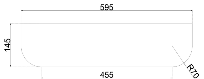
▲ front view