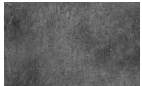
780 ETCHED SLATE