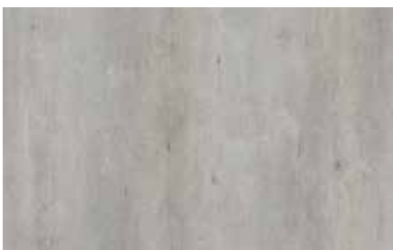
730 CONCRETE ASH