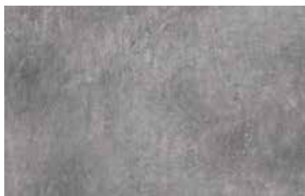
770 ETCHED PEARL