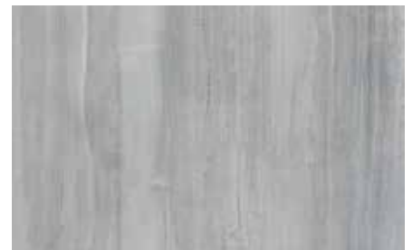
705 SANDSTONE MIST