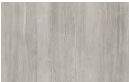
500 SANDSTONE LATTE