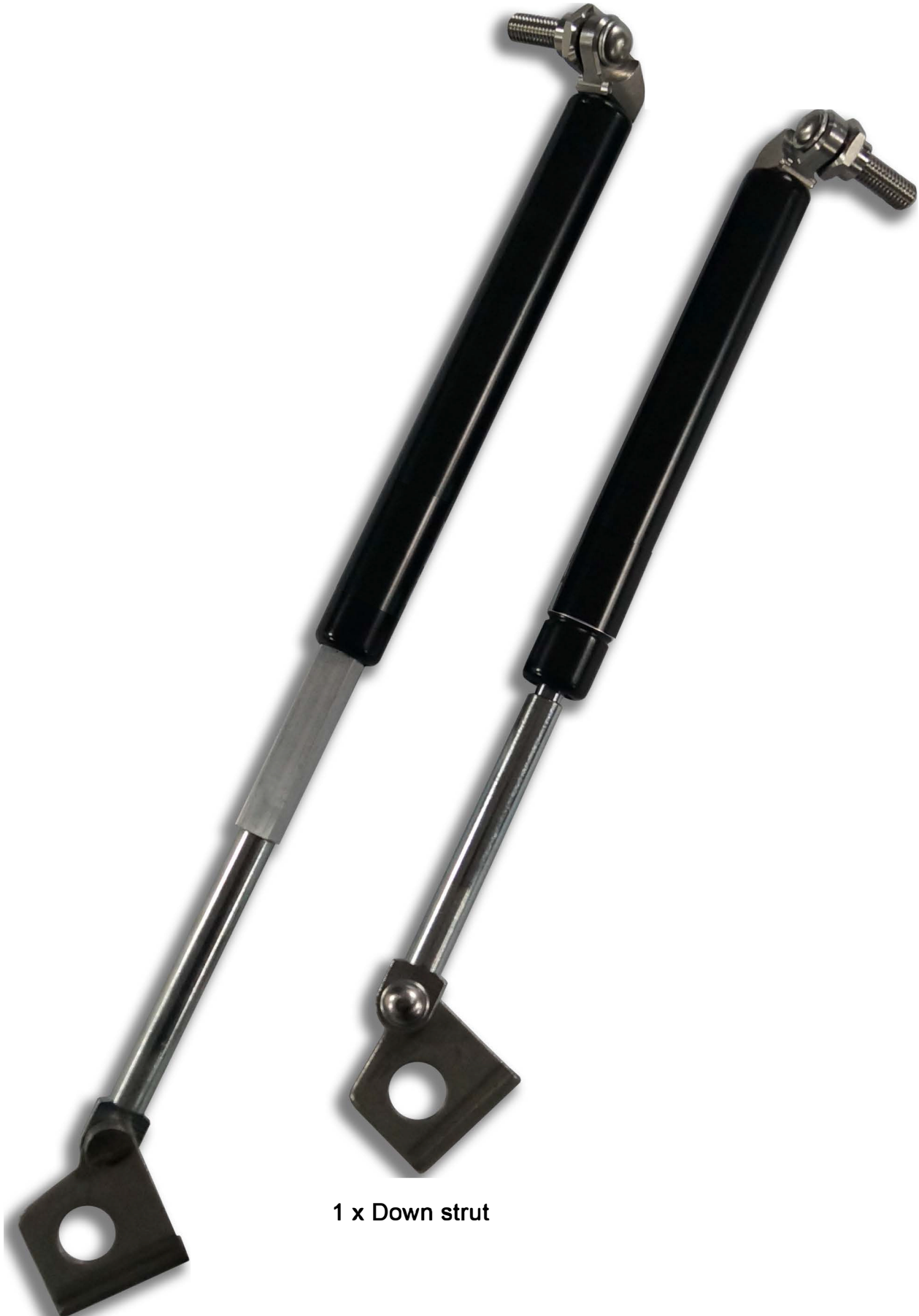
1 x Down strut