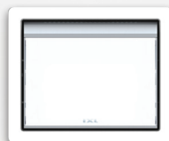
Luminate Heat Module