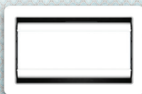
Luminate Vent & Light Module