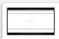
Luminate Vent Module

Purchase any IXL product from the Tastic Luminate range for a chance to WIN a new Roomba i7 Robot Vacuum (RRP $1499)