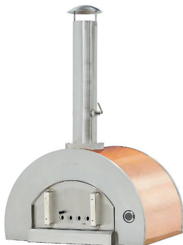
Pizza Oven GRANDE