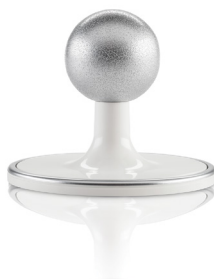
Table & Ceiling Mount

Use this mount freestanding on a table or secure it to the ceiling with included mounting screws. Simply snap the camera onto the magnetic ball and aim it in any direction you want.