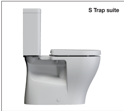
S Trap suite