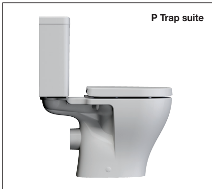
P Trap suite

Caroma Coolibah is a range of contemporary essentials designed to suite your lifestyle. Combining an enduring design with rimless pan technology, the Luna Cleanflush™ is a superior flushing system suitable for domestic and commercial applications. Incorporating several patented technologies: Caroma Flow Splitter™ and Caroma Flow Balancer™, the Cleanflush™ pan is innovative and the next evolution in toilets. The S-Trap suite features the Caroma Orbital® connector, a patented 50mm variable offset connector for increased flexibility on setout. The Luna cistern is an integrated system with a high performance outlet valve, fitted with low profile push buttons and is available in a 1/2" B.S.P. back entry option which completely conceals the inlet stop valve and connections for a seamless look.